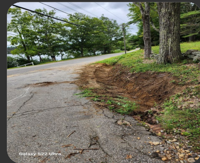
Ditch Dug to cross pipe Crystal Lake Rd.