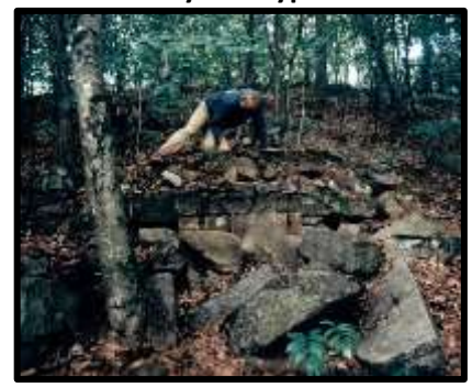
Town Farm Burial Ground